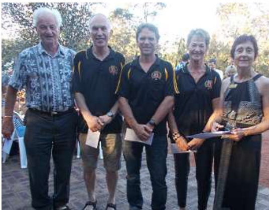
Best Kalamunda Team: