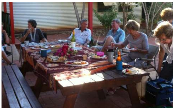
Table fees of just $5.00 covers the cost of afternoon tea, room rental at Lotteries House plus their storage of our tables, cards, boards, travelers etc. The fees also assist in the funding of our end of season celebration which this year will probably be held after bridge on Tuesday 27th August, the last day that the club will function for the year.

During 2012 our sessions had not less than five and as many as nine tables. Players came from all over Australia and some from overseas. Some could only attend for one session while the "regulars" made all nine sessions.